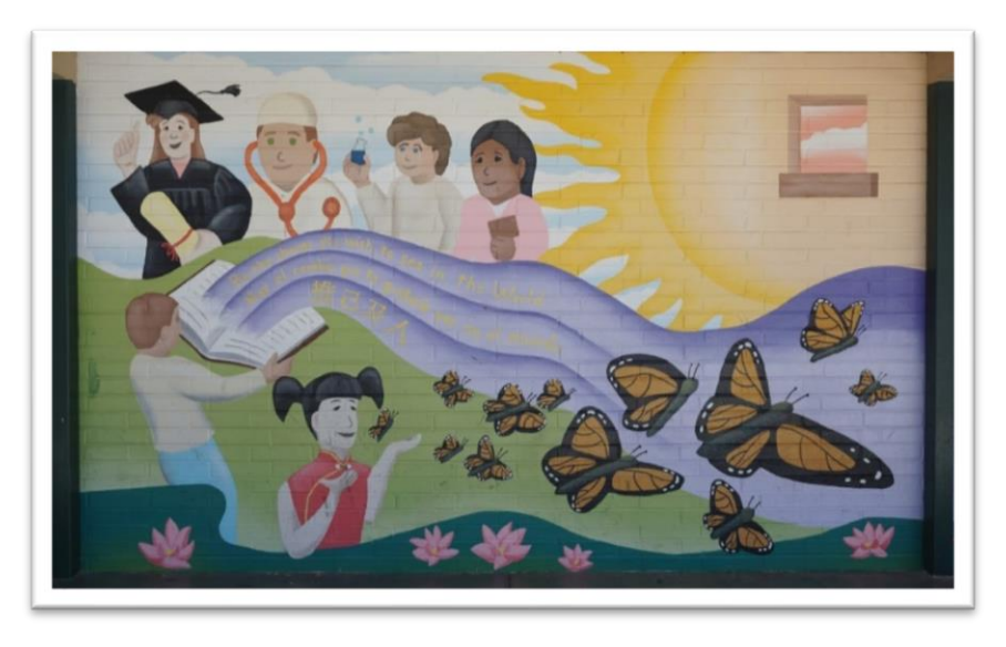
Figure 2: A mural at San Antonio Elementary (1967)

"To improve local neighborhood schools, fix leaky, deteriorated roofs, improve fire safety, repair/upgrade classrooms, improve student safety and security, renovate outdated restrooms, upgrade heating/ventilation/electrical systems for energy efficiency, and computer technology, shall $139,999,671.60 of Alum Rock Union Elementary School District bonds approved by the voters in June 2008, be reapproved at legal rates to renovate, acquire, construct, repair classrooms, sites, facilities/equipment, with independent audits, citizens' oversight, no money for administrators' salaries and all money controlled locally?"