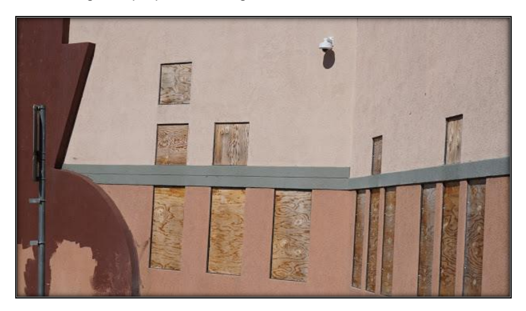
Figure 5: Work remains at the Mathson multipurpose building

The District already owns one existing multipurpose building on the Mathson campus. The building has stood vacant for multiple years and has been subjected to repeated vandalism. Restoring the building would require a substantial investment of funds, but would likely be less costly than constructing new multipurpose buildings. In addition, the building is home to many murals, still in good condition, of cultural significance. During the 2017-2018 fiscal year for the reasons noted in the section "Conditions Impacting the ARUSD Bond Program 2017 / 2018," there was not enough bond money available to move forward with the construction of new multipurpose buildings or the restoration of the existing multipurpose building.