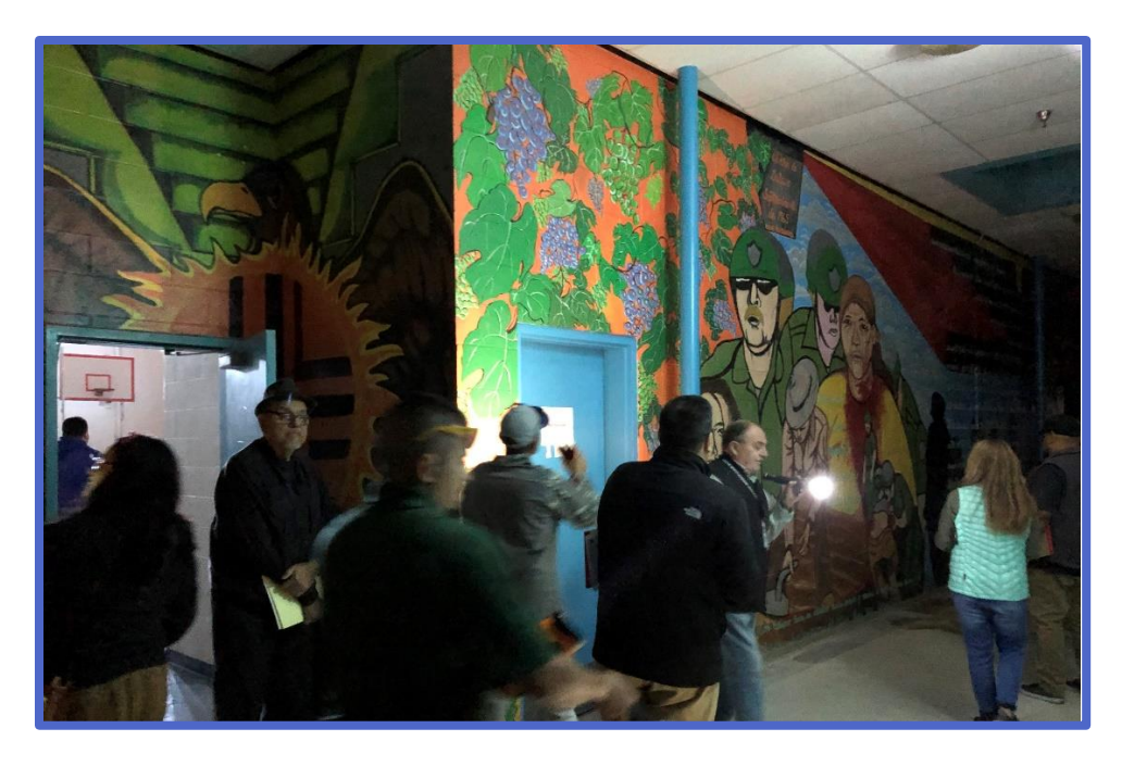
Figure 4: The CBOC and District staff view some of the many intact murals at the former MACSA building

SUMMARY OF MEASURE J PERFORMANCE AUDIT, FINANCIAL STATEMENTS, AND INTERNAL CONTROLS REPORT