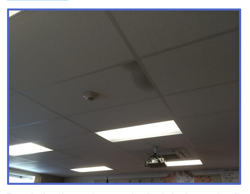
Figure 3: Leaking refrigerant can be seen saturating ceiling tiles in a classroom at Dorsa Elementary

On the CBOC site visit of LUCHA and Dorsa in November 2019, observers could see discoloration in ceiling tiles that we were told were coolant and other lubricants that have been leaking from the HVAC systems infrastructure. Both district and school administrators fear that continued use of HVAC systems while compromised could do structural damage to buildings, in addition to further compromising the HVAC systems. As a result they have been advised not to use the HVAC systems at all. The District had to incur additional costs to be able to get the system functioning; however, a permanent fix is still needed.