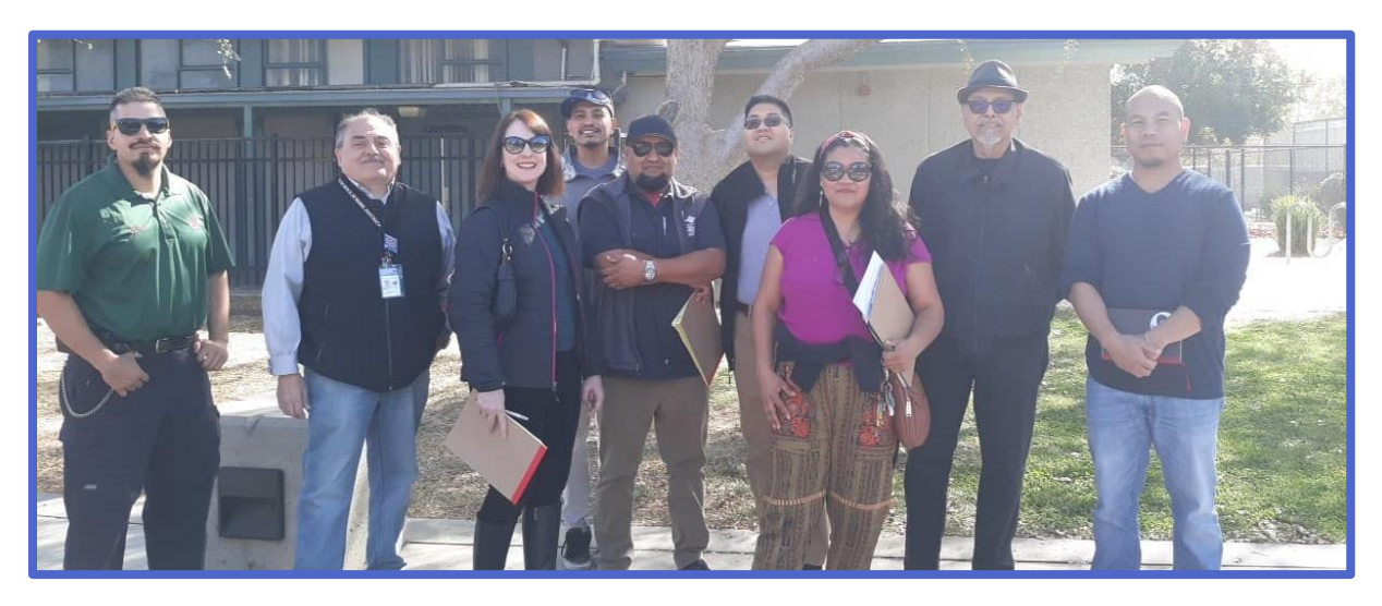
Figure 1: The CBOC and District staff on a site visit to Dorsa Elementary

We are pleased to deliver the Citizens' Bond Oversight Committee's 2019 Annual Report to the Alum Rock Community. This Annual Report will include a response to the bond performance and financial audits. The Citizens' Bond Oversight Committee (CBOC) currently oversees funds from Measure J, and is also responsible for oversight of Measure I, where bonds have yet to be issued.